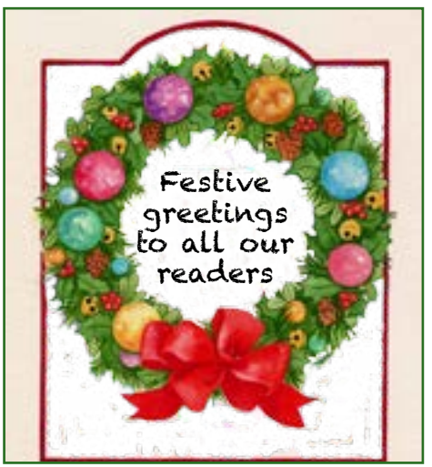
Masthead picture