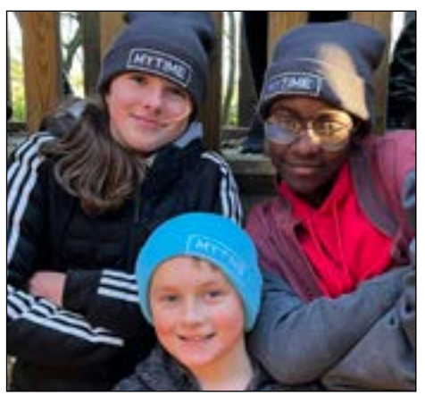
Thirty young carers enjoyed a brilliant visit to Adventure Pirates in Lychett Minster as part of the Carers Dorset Festival. Please turn to page 23.